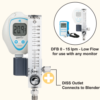
DFB with MaxO2+A - 0 - 15 lpm - Low Flow